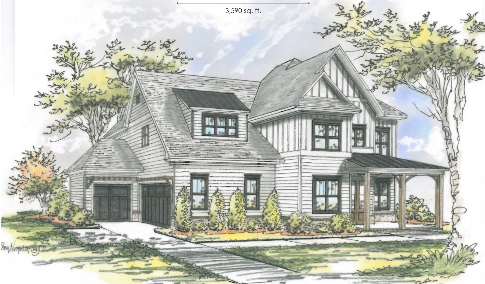
Artistic rendering of plan elevation. Actual plan may vary slightly.