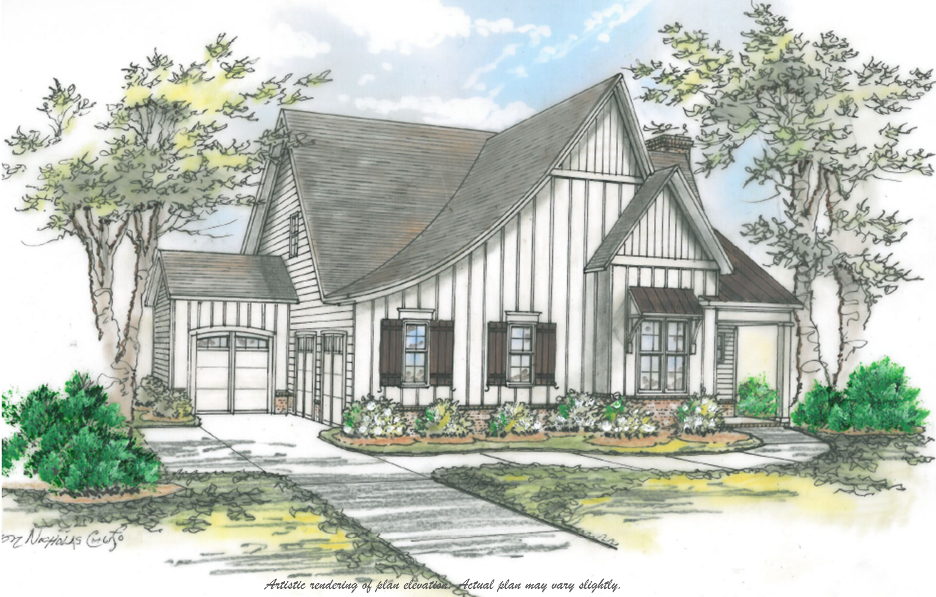
Artistic rendering of plan elevation. Actual plan may vary slightly.